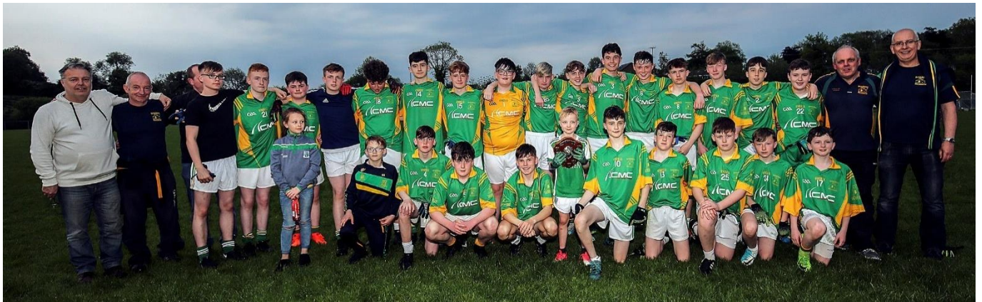
Irvinestown Naomh Molaise – U15 FL Div 2 Winners 2018

The draw for the U15 Football Championships will take place once the U15 Football League Finalists are known (Regulation 5).