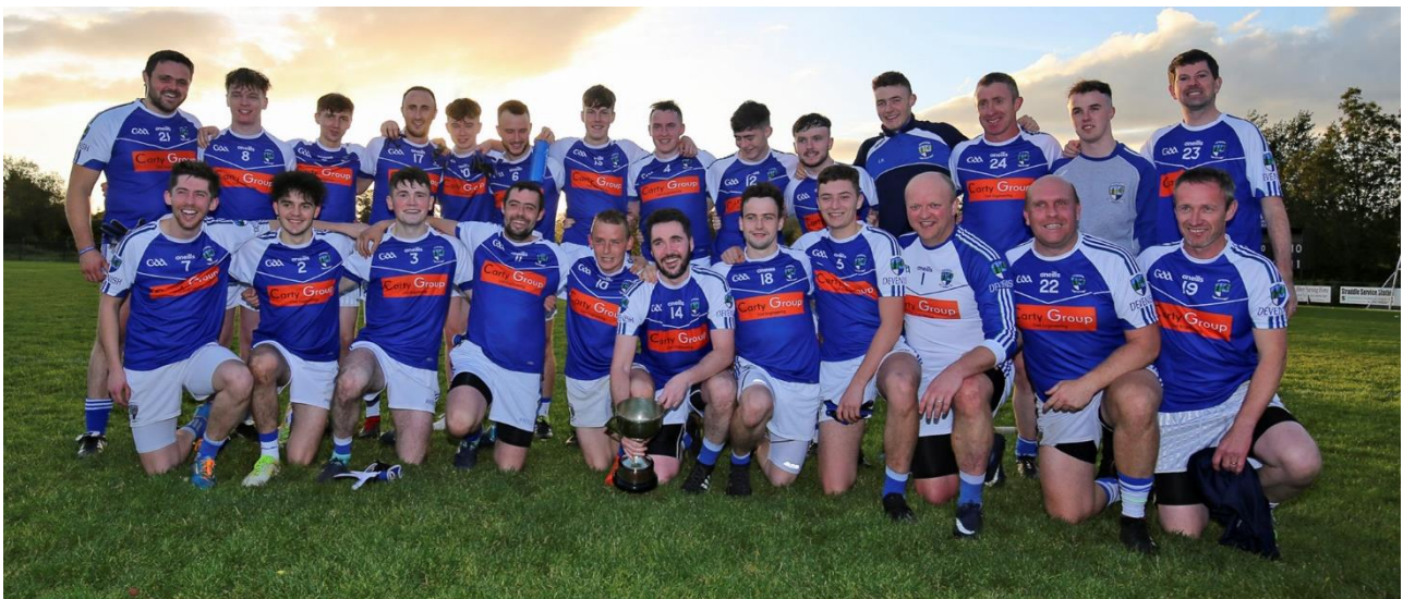
Devenish St Mary's – RFC 'B' & Erne Cup 2 Winners 2018