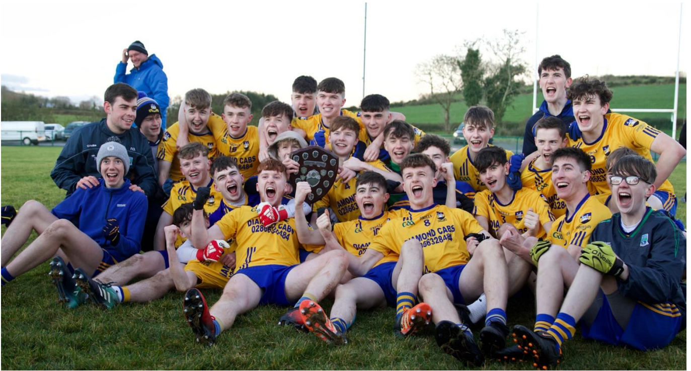
Enniskillen Gaels – U17 A FC Winners 2018