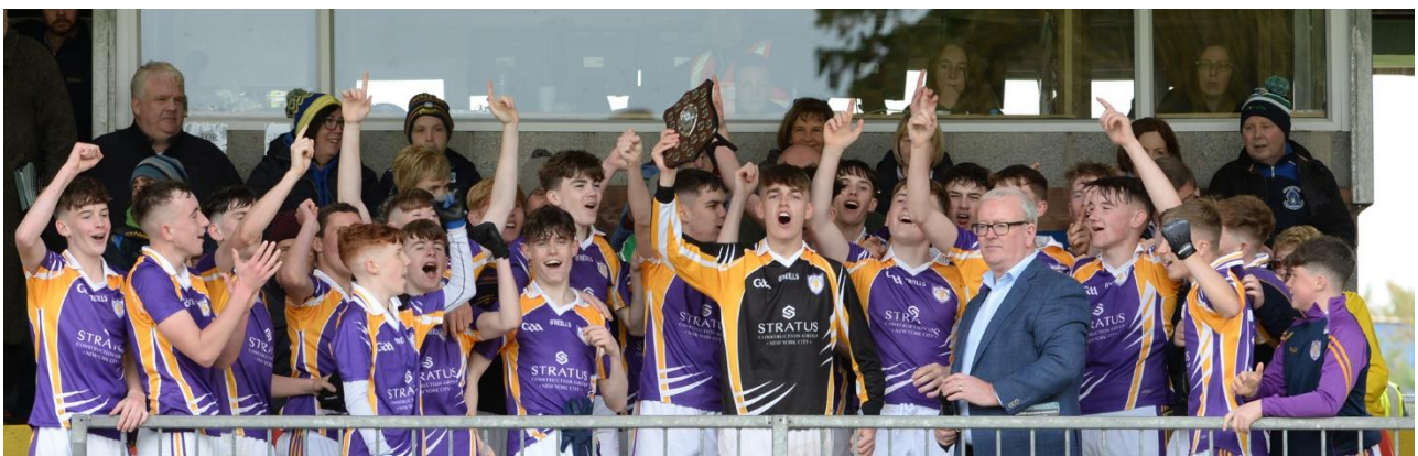
Derrygonnelly Harps – U17 Division 1 Winners 2018