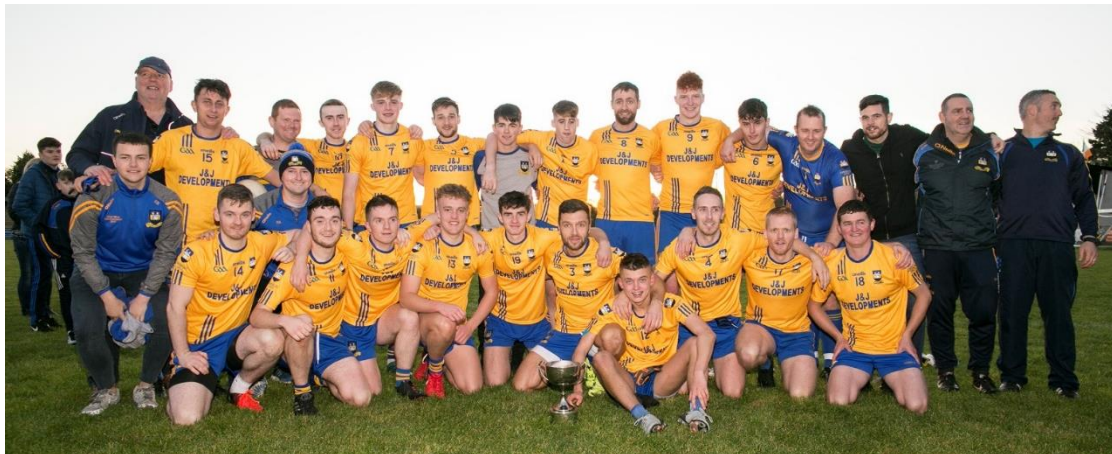
Enniskillen Gaels – SFL 2 Winners 2018