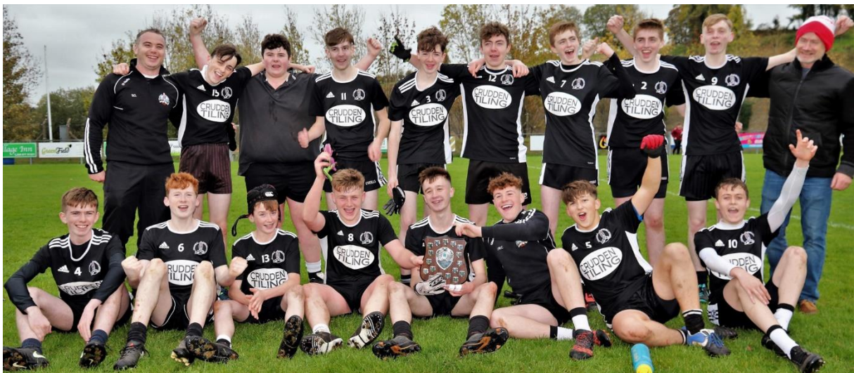
Aghadrumsee St Macartans – U17 FL Division 4 Winners 2018