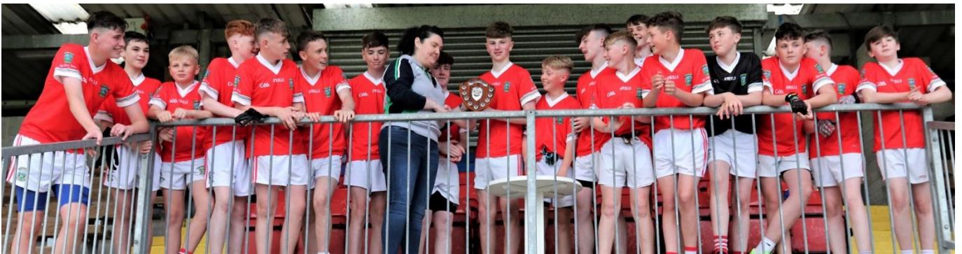
Newtownbutler First Fermanaghs – U15 A FC & U15 FL Div 1 Winners 2018

The Rounds of Fixtures for the U15 Football League will be confirmed once the number of teams taking part is known and the gradings decided. This will be communicated no less than 14 days before the beginning of the competition.