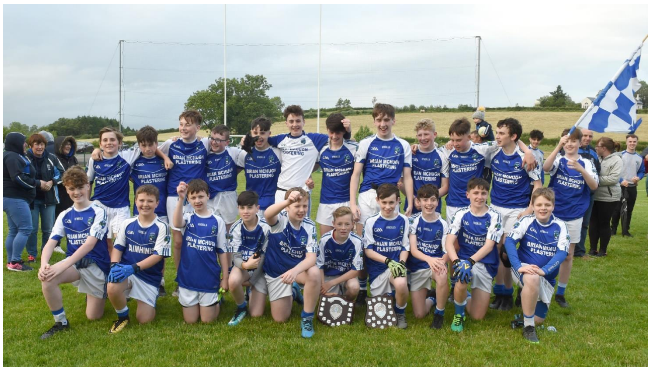
Devenish St Mary's – U15 B FC & U15 FL Div 3 Winners 2018