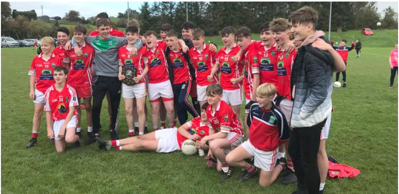
Newtownbutler First Fermanaghs – U17 B FC Winners 2018