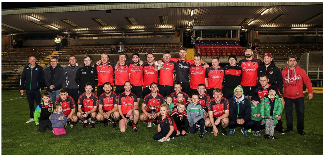
Maguiresbridge St Mary's – SFL 3 Winners 2018