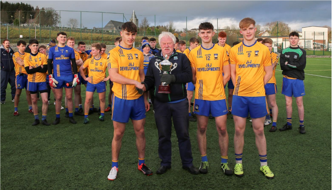
Enniskillen Gaels - U21 A FC Winners 2018

their amendment or deletion shall quote the number of the regulation to be amended or deleted. Fermanagh GAA regulations shall be reviewed annually.