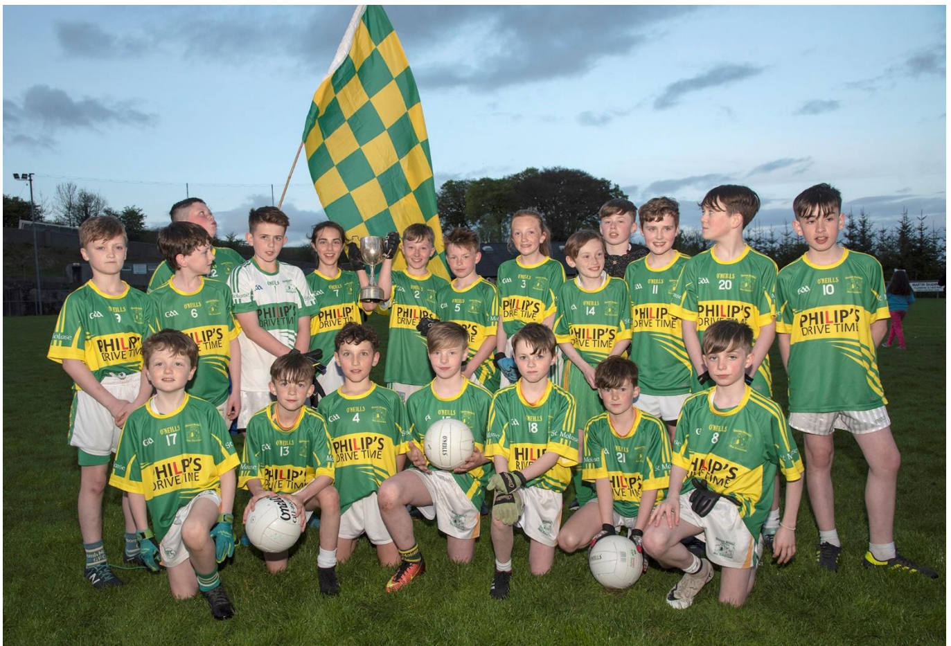
Irvinestown Naomh Molaise – U12 Division 1 Winners 2018

The Rounds of Fixtures for the U11.5 Football League will be confirmed once the number of teams taking part is known and the gradings decided. This will be communicated no less than 14 days before the beginning of the competition.