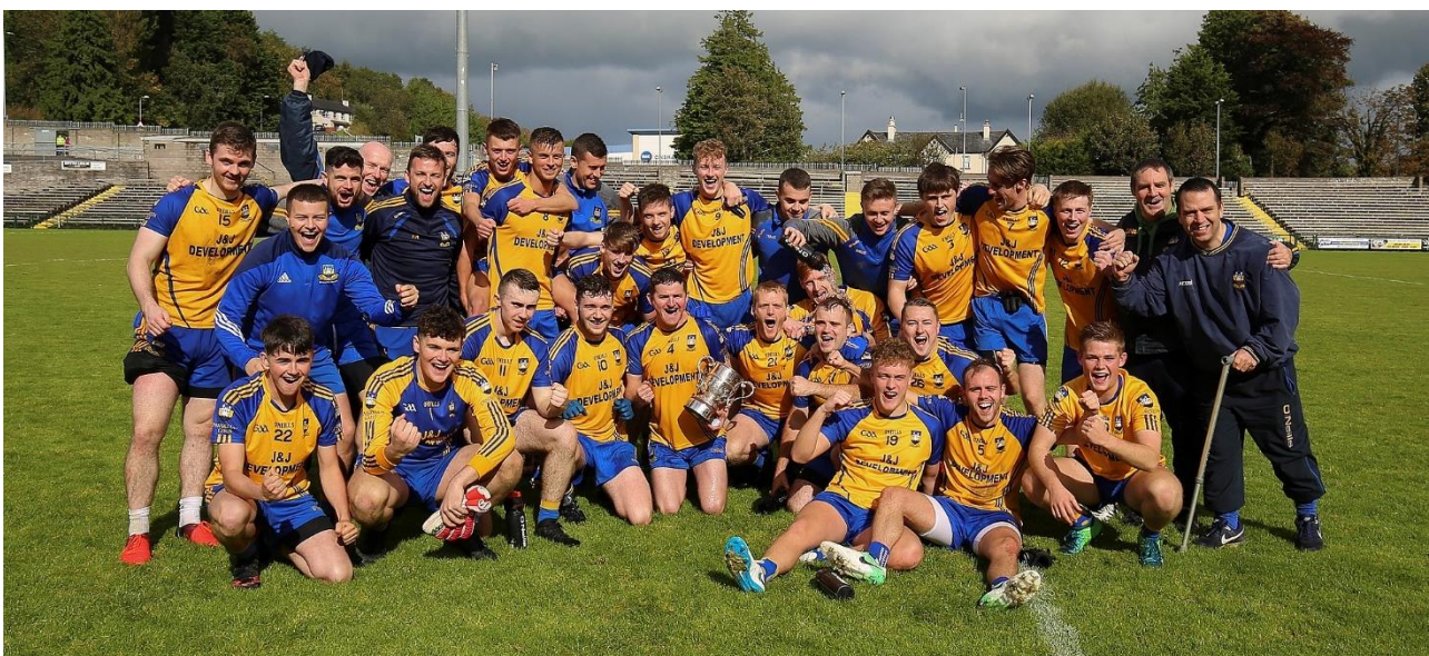
Enniskillen Gaels – RFC A Winners 2018

The dates for these games may be subject to change depending on replays in the SFC, IFC or JFC or on the make-up of the teams in the finals and their continued involvement in the SFC, IFC or JFC at that stage.