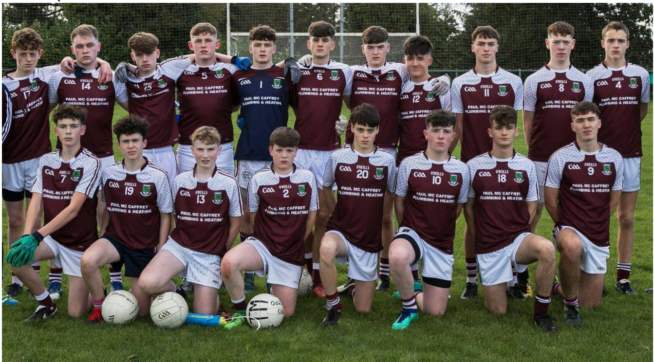
Tempo Maguires – U17 FL Division 2 Winners 2018

The Rounds of Fixtures for the U17 Football League will be confirmed once the number of teams taking part is known and the gradings decided. This will be communicated no less than 14 days before the beginning of the competition.