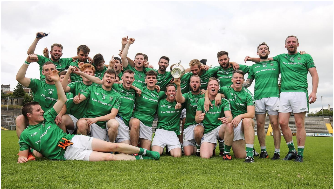
Roslea Shamrocks – Erne Cup 1 Winners 2018