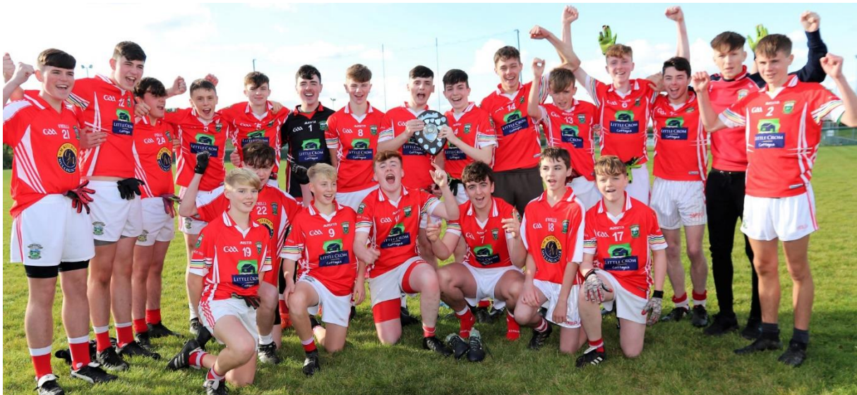
Newtownbutler First Fermanaghs – U17 FL Division 3 Winners 2018

The draw for the U15 Football Championships will take place once the U15 Football League Finalists are known (Regulation 5).