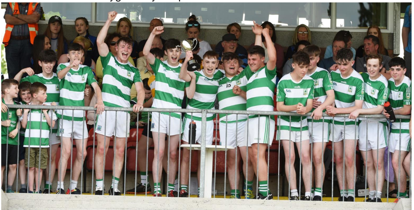
Teemore Shamrocks – U18 B FC Winners 2018