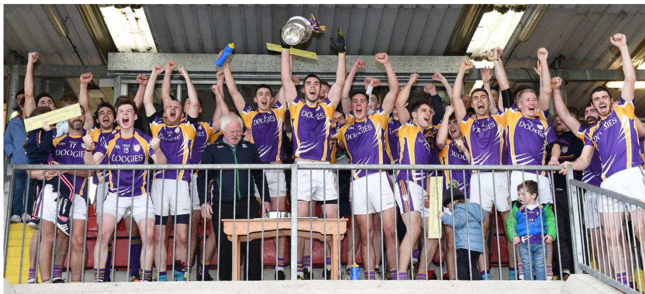
Derrygonnelly Harps – SFC Champions 2018