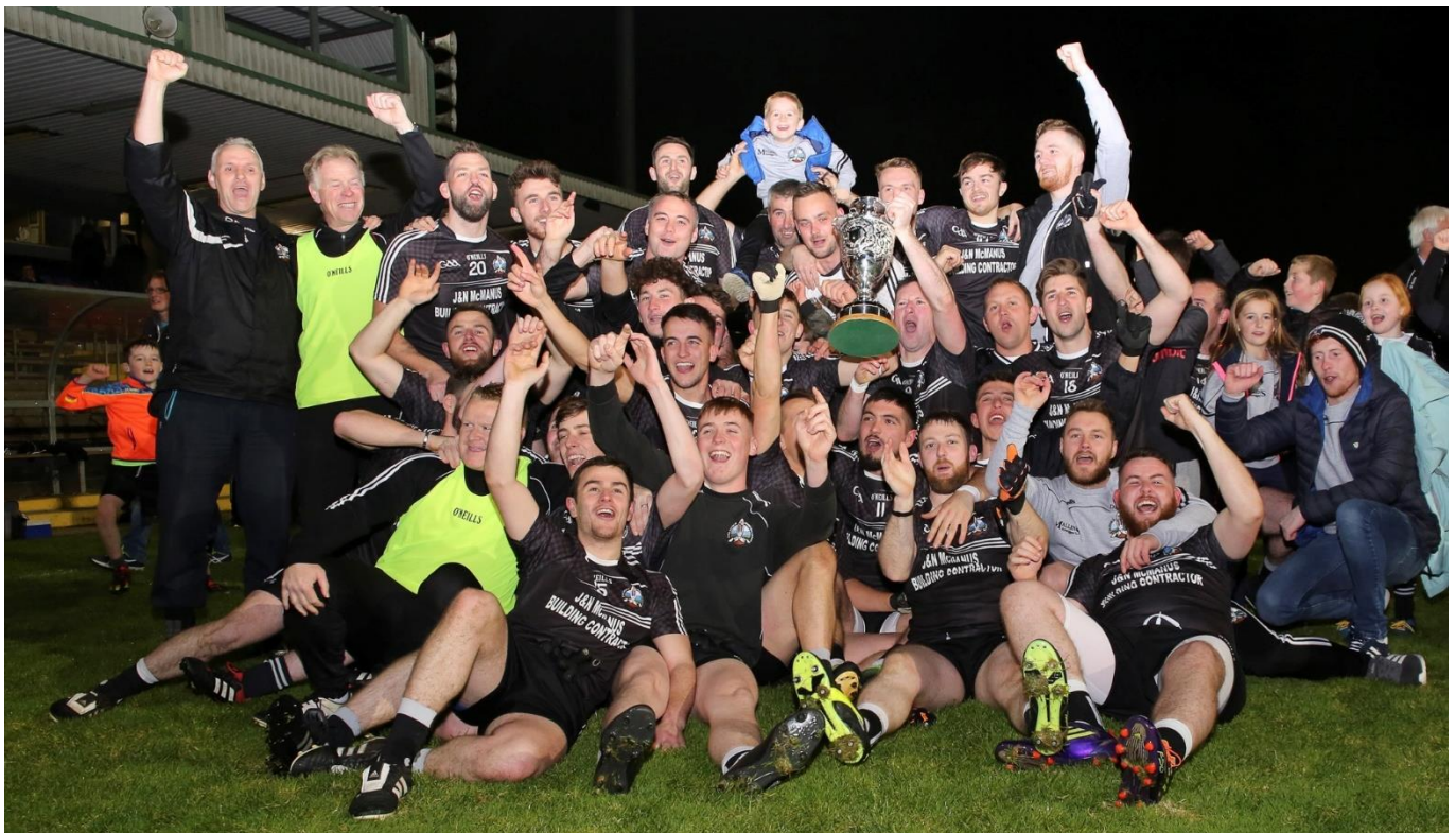
Aghadrumsee St Macartan's – JFC Champions 2018

If we were to play the championship block before the 18 rounds of senior league games were concluded, it is very hard to get teams motivated to return to playing rounds of league football and this leads to increased numbers of conceded games.