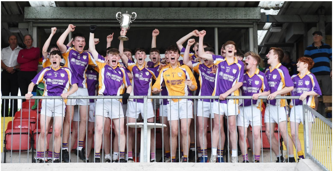
Derrygonnelly Harps – U18 A FC Winners 2018

We have continued the practice of setting Monday evenings aside for hurling and for ladies football within the county. No games are being organised for Monday evenings and clubs are once again asked not to arrange training for Monday evenings.