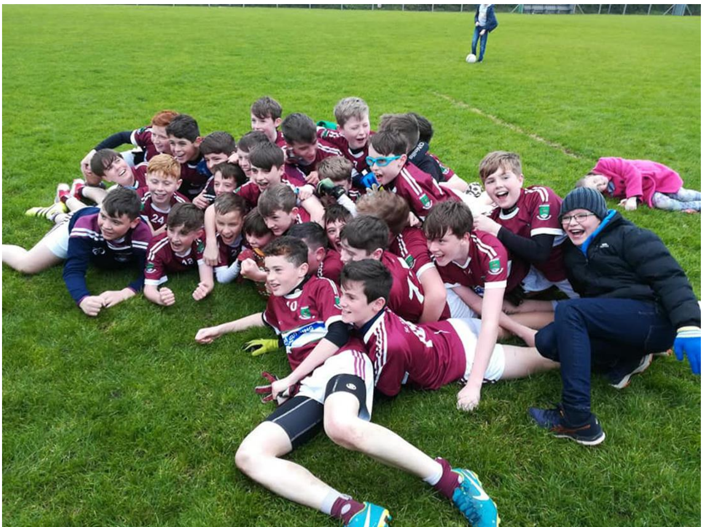
Tempo Maguires – U13 Division 2 Winners 2018

Féile Peil na nÓg will take place on 29 th and 30 th June 2019. The requirement for the number, and standard, of teams representing Fermanagh will be determined by the National Féile committee in due course. This will determine the competition structure put in place in Fermanagh.