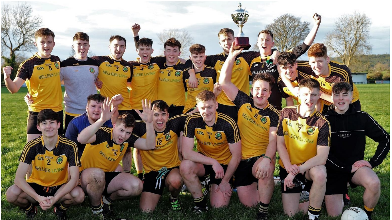
Erne Gaels - U21 B FC Winners 2018